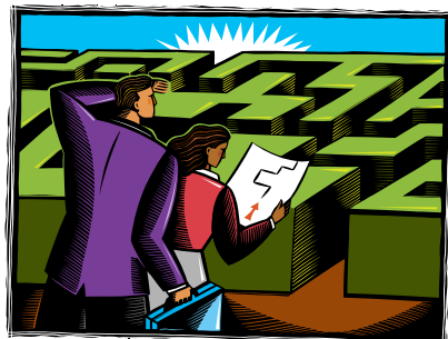
Very Interesting . . . page 29