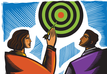
Working with a Financial Advisor, p. 16