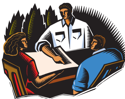
Scruples, p. 10