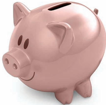
ABLE Accounts. p. 18