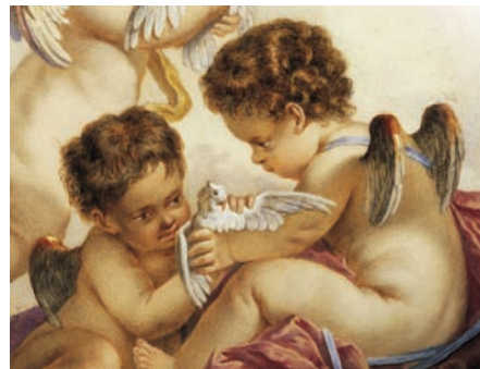
Seven Virtues of Ethics and Professionalism p. 9